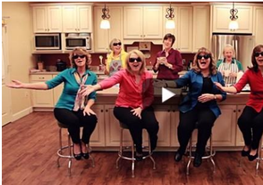
"Don't Worry, Mommy!" with HSLDA Education Consultants

This cleverly choreographed music parody mixes sometimes tongue-in-cheek advice with a steady reminder that you've got this, Mommy.